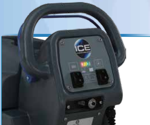
USER FRIENDLY TOUCH PANEL CONTROL SYSTEM