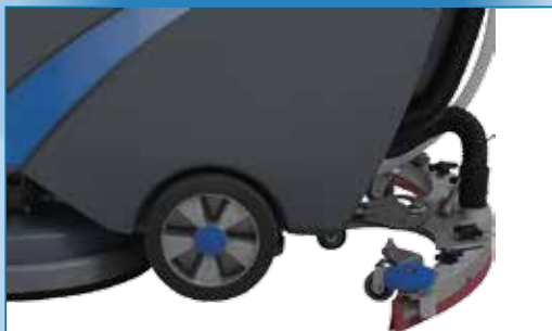
DIE-CAST ALUMINUM CURVED SQUEEGEE AND WHEELS